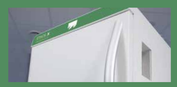
SAFETY AND RELIABILITY