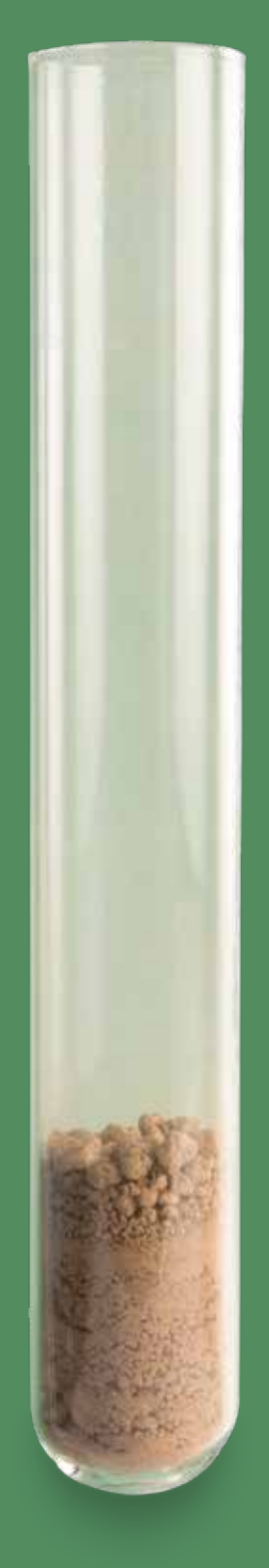
30 gram soil sample in disposable glass vials (actual size)