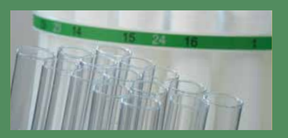
SUPERIOR RETURN ON INVESTMENT